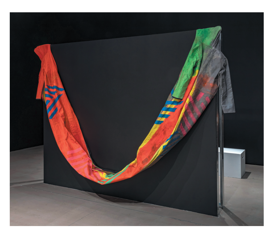
Native Art Department International, Double Shift , 2018, painted canvas, 2.9×1.3 cm