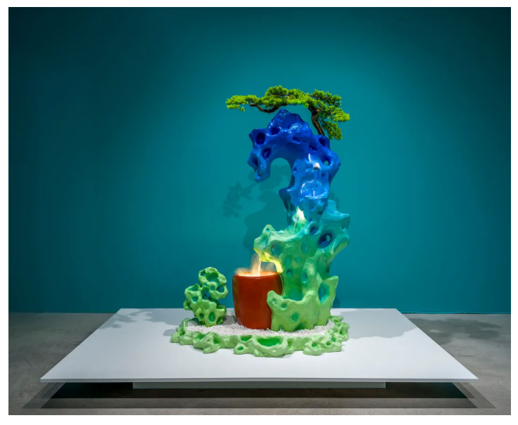
Shellie Zhang, Gazing at a Waterfall, 2023

Thematically inspired by Chinese Wuxing, the depiction of natural elements alongside mass-produced merchandise evokes questions around the "authenticity" of these objects. Are the fruits edible? Are the rock-bricks found or made? And is the pink coral actually made of wax or plastic? The dynamic ambiguity characterizes a kind of visual language of diaspora's desire to be connected to ancestral culture in domestic spaces. Similar to our desire for natural elements at home during the COVID-19 lockdowns, practices such as feng shui and displays of culturally meaningful objects reveal a diasporic yearning for distant homelands.