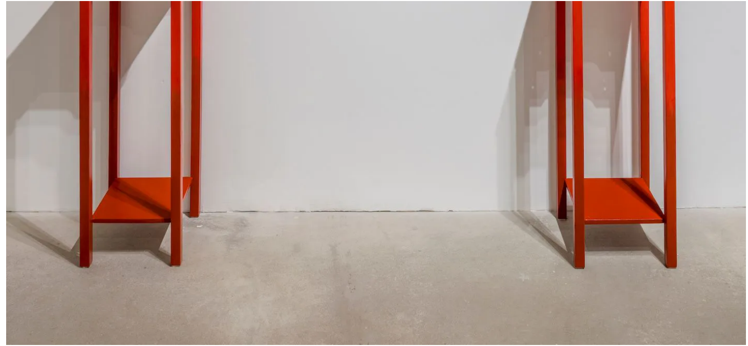
Shellie Zhang, Earth Elemental, 2023

Red marble patterns stretch energetically behind a collection of bricks and Chinese scholar's rocks. Aqua ripple patterns complement the hot-pink coral and light-orange conch with pearls scattered in the foreground. These vibrant visuals from Shellie Zhang's photography and installation series Elemental (2023) generate unique encounters with household items that are meticulously recontextualized in dreamlike, nature-inspired settings, inviting us to reflect on the personal, cultural, and aesthetic meanings within the mundane objects in our living environments.