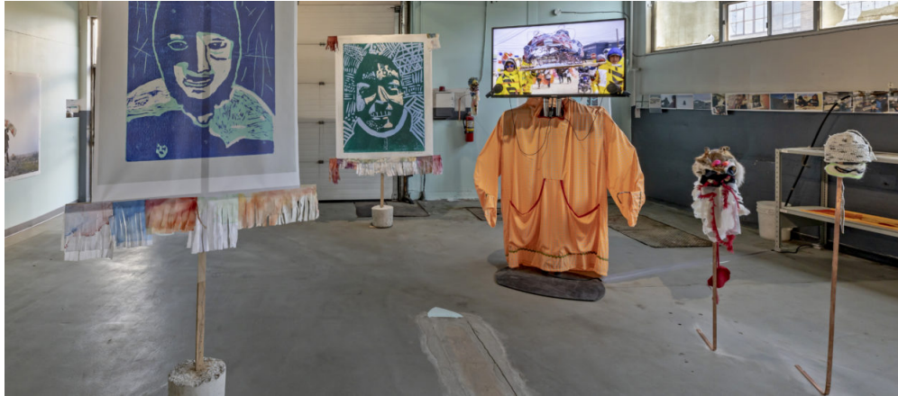
Embassy of Imagination + PA System, Sinaaqpagiaqtuut/ The Long-Cut , 2019, mixed-media installation. Commissioned by the Toronto Biennial of Art. Presented in partnership with The Bentway. On view at 259 Lake Shore Blvd E as part of the Toronto Biennial of Art (2019).