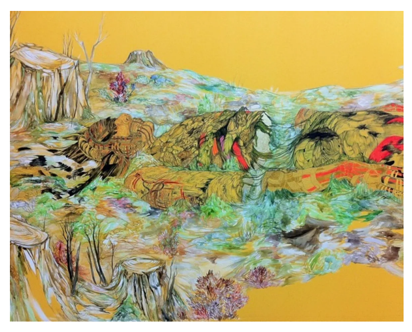
Marigold Santos. re-grounding (detail), 2011. (www.marigoldsantos.com)

All the figures in Santos's art are Asuangs of a sort, she says. A mysterious woman might appear quartered, only to be stitched back together with rocks and prairie grasses, the literal landscape of Alberta. Or a figure might be cloaked in woven fabric, a web of sky or flowers or artifacts of where she's been.